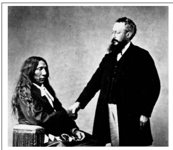
Photograph of William with Chief Red Cloud.

The Blackmore Museum opened in September 1867. The Encyclopædia Britannica described it as "one of the finest collections of prehistoric antiquities in England." Later the two museums were amalgamated and, following Humphrey Blackmore's death in 1929, much of the Blackmore collection was distributed to other museums.